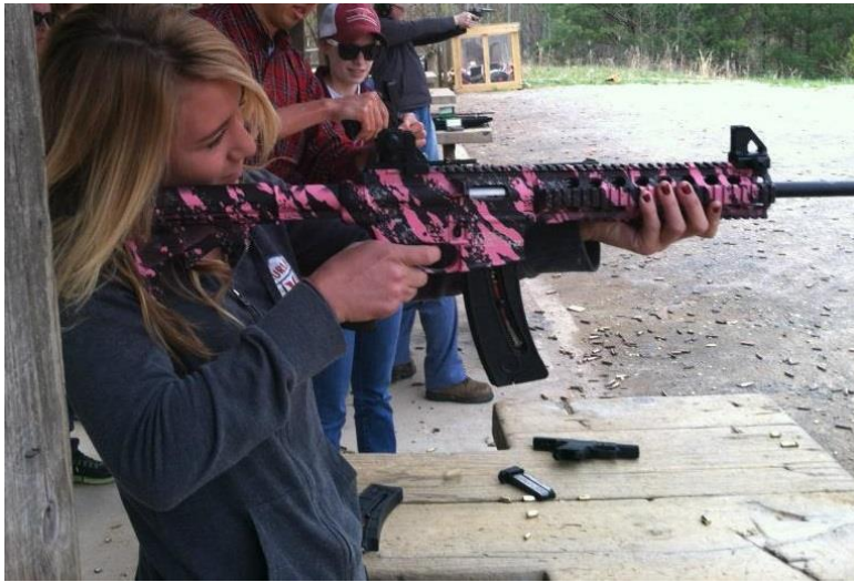
(YAL member at range day)