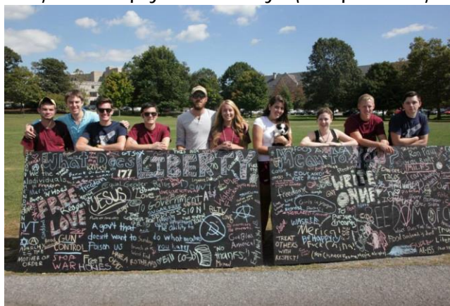
(“Freedom wall” on the drill field.)